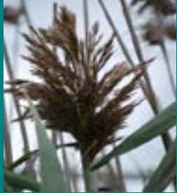
Invasive species - Phragmites

Environmental Protection Agency - Green Acres Fact Sheet