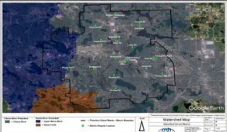
Waterford School District Watershed Map

Recognizing the different watersheds in the area increases opportunities for participation in multiple watershed groups and related activities. Stewardship can be fun, even when we join with groups outside of our community. Learn how different communities protect their watersheds while enjoying kayaking, fishing, or other outings. There are numerous educational opportunities for individuals or groups. It is a great way for children and families to become involved in their community, develop leadership skills, and have fun while helping protect our watersheds.