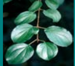
Invasive species - Common Buckthorn