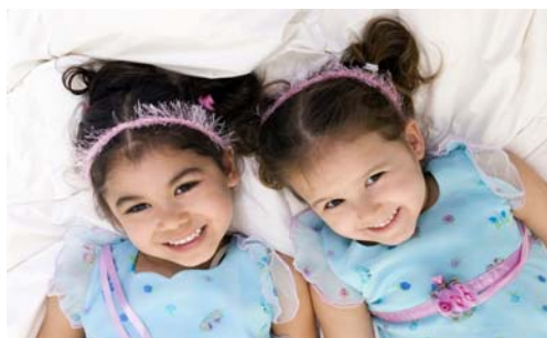
Pre School Age