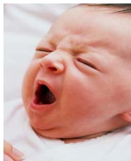
Infants & Pre Walkers

Dandi Lions Child Care is arranged around distinct developmental age groups which allows for better planning of quality, developmentally appropriate activities for each group: